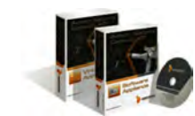
AWG Virtual Appliance